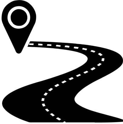
Created by chiara ardenghi from the Noun Project

north end at Cedar Grove Road to Route 9, a distance of about two miles.